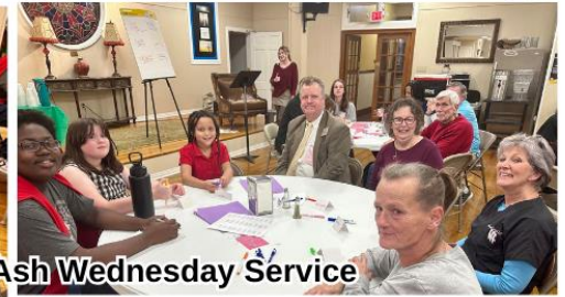
Intergenerational games for Valentine's Day prior to the Ash Wednesday Service